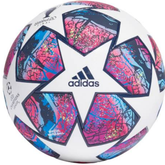
CCL Match ball: size 5 adidas Champions League Match Ball